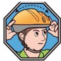
TEST THE FIT