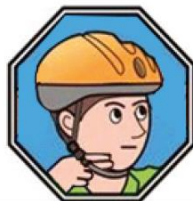
ADJUST THE CHIN STRAP