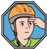
POSITION THE HELMET