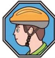
ADJUST OTHER STRAPS